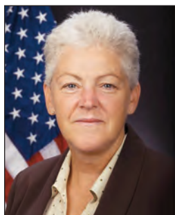
EPA Administrator Gina McCarthy

The Senate confirmed Gina McCarthy to lead the EPA on July 18, ending a four-month battle with Senate Republicans. McCarthy was approved 59-40, with six Republicans joining all but one Democrat, Joe Manchin of