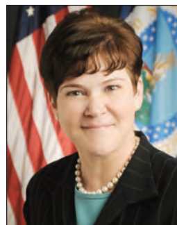
USDA Deputy Secretary Krysta Harden