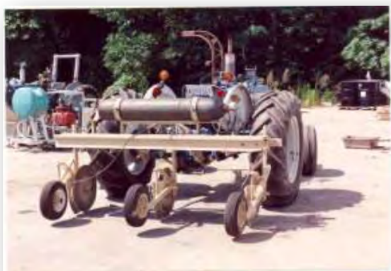
Modified Injector System with Cutting Disk and Rear Wheel Furrow Sealer.