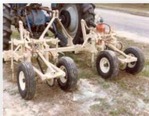
'Sewing Machine' Punch Injector for use in Lawns, Gardens, Highway Rights-of-Ways, etc.