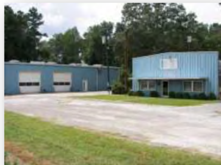
The USDA APHIS Whiteville Plant Methods Center, Whiteville, N.C.