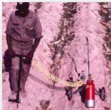
Handheld Ethylene Injector Probe – Used to Control Witchweed in Africa.

Of particular note is the ethylene injection equipment that he designed and developed at the Whiteville Center that made it practical to induce suicidal germination of 99% of viable Witchweed seeds in infested fields and other sites (Figure 1). This is but one of many examples of his ability to take complex problems and develop practical, real world solutions for them.