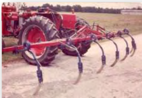
Original Tractor-mounted Ethylene Shank Injector System – 1970.