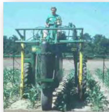
High Boy Tractor Ethylene Injector System.