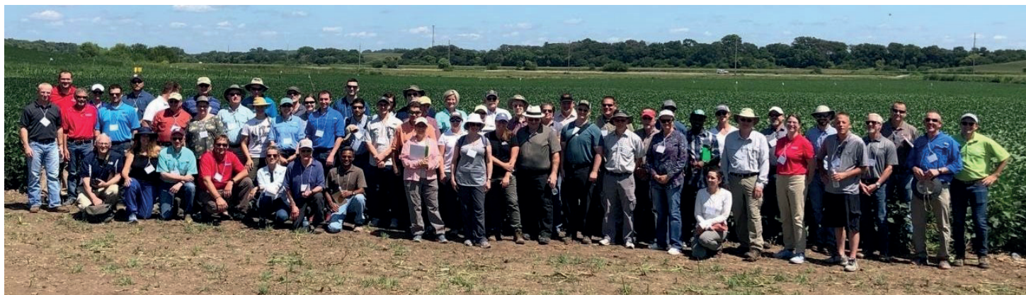
Figure 2. Attendees at the Science Policy Experience pose for a picture in front of a field trial in Logan County, IA testing different herbicide resistance management practices.

listen to each other and ensure that everyone's voice is heard. Insightful questions based on mutual understandings should be asked and perspectives shared to create shared goals and values. We draw on these principles to evaluate the structure and outcomes of the 2019 Science Policy Experience as an early-stage effort to facilitate community-based formation and management of these “wicked problems”—that is, problems to which there are no definitive and objective solutions (Jussaume & Ervin 2016; Rittel & Weber 1973).