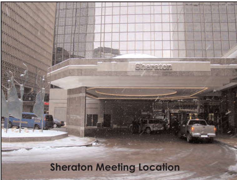
Sheraton Meeting Location