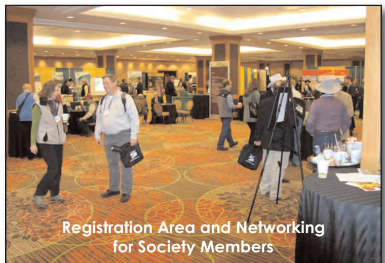
Registration Area and Networking for Society Members