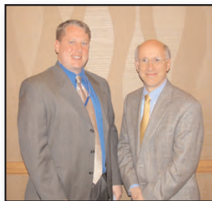
Photo contest awards were presented with support from Marathon Ag/Environmental and Monsanto.

Assistant Professor and Extension Weed Specialist Michigan State University East Lansing, Michigan