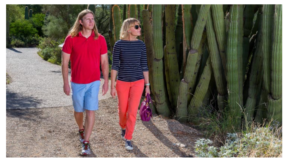
Arizona-Sonora Desert Museum - Organ Pipe Cactus, courtesy of Jay Pierstorff