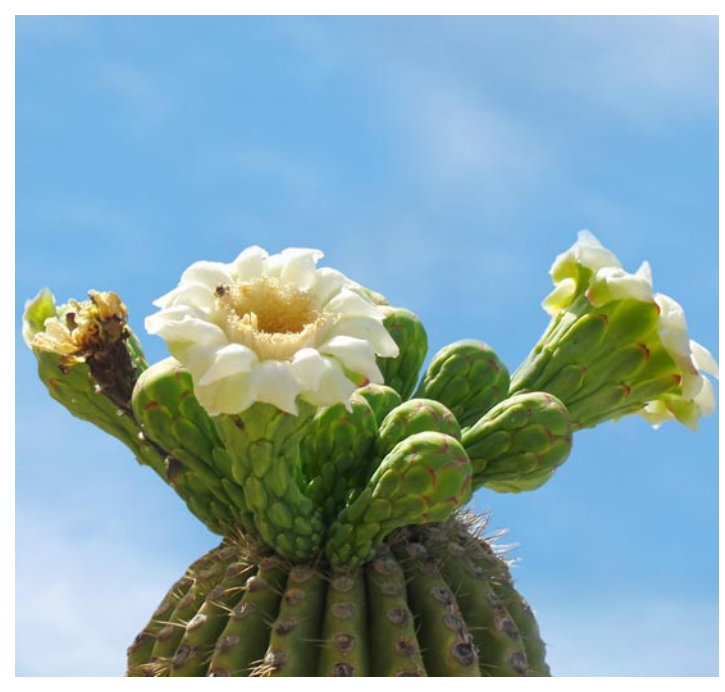
Saguaro Flowers