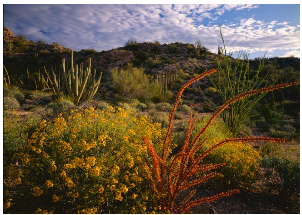
Desert Flowers in Bloom

Written notice of cancellation received on or before January 13, 2017 will be refunded, less a $50 processing fee. No refunds will be issued for cancellations after January 13, 2017 . Participants unable to attend the conference can make substitutions.