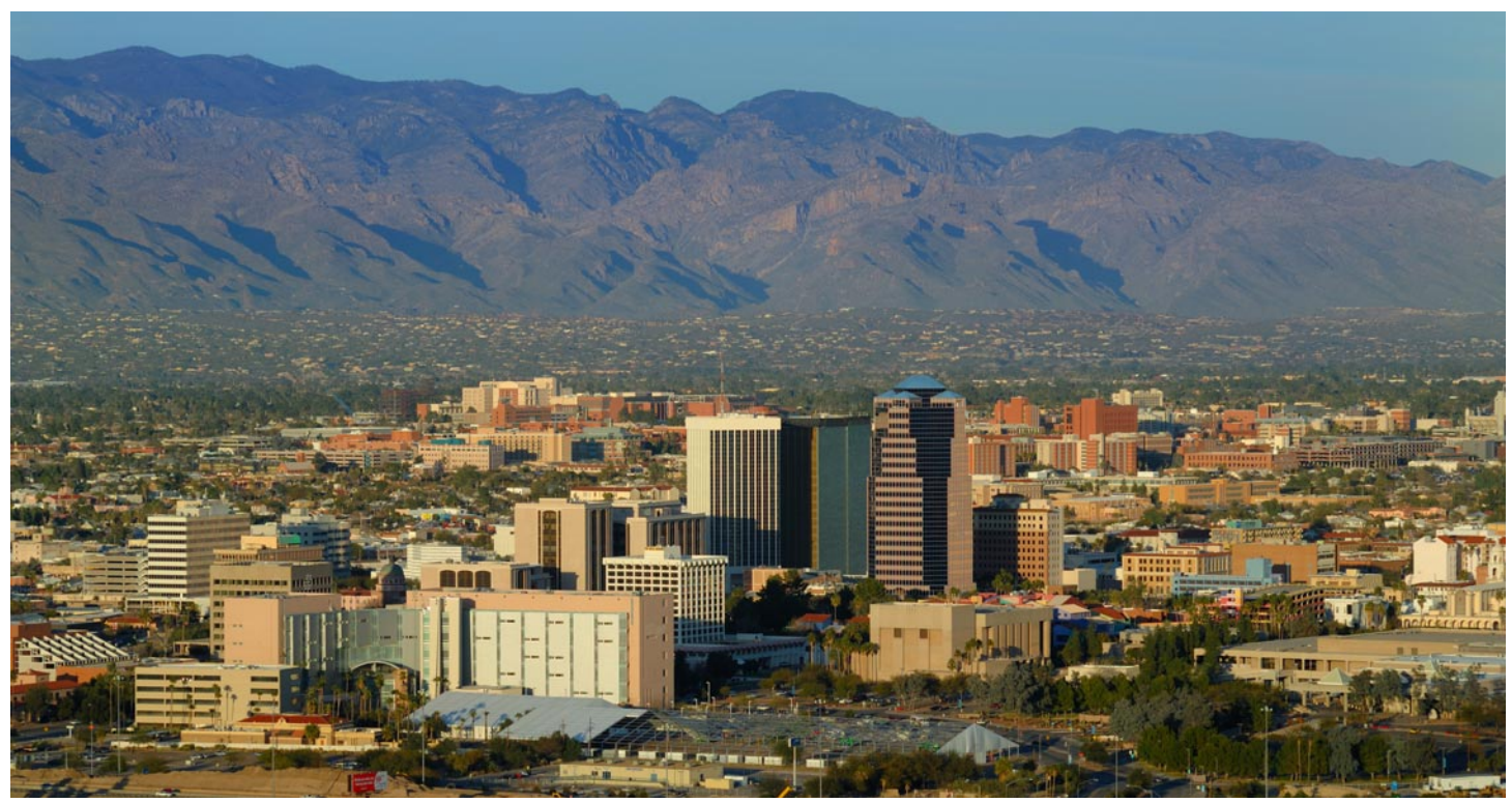
Tucson Skyline