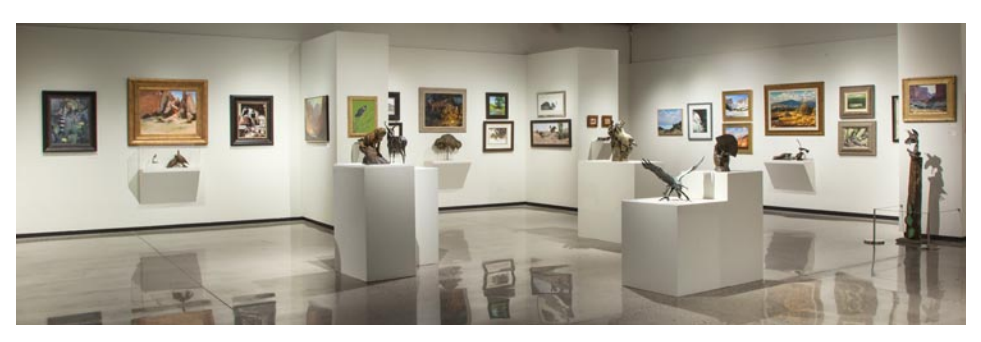
Arizona-Sonora Desert Museum - Ironwood Art Gallery