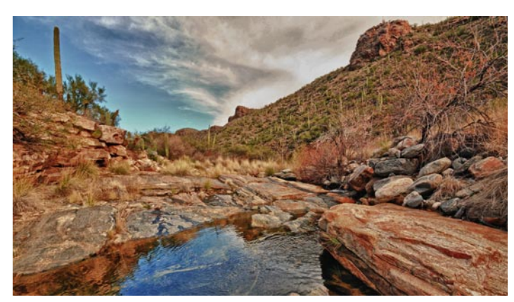
Bear Canyon Pools