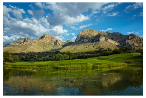
Oro Valley El Conquitador, Pusch Ridge Course #5, courtesy of Hilton Tucson El Conquistador

On Sunday, February 5th there will be a golf tournament with proceeds going to the WSSA Endowment Fund. The tournament will be held on the 9-hole Pusch Ridge Course, located on the property itself. The Pusch Ridge Course is one of three courses at the El Conquistador. The hotel's location at the base of the Santa Catalina Mountain Range ensures spectacular views.